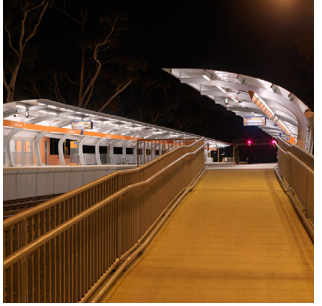
The project entailed relocation and upgrade of an existing railway station, to locate the new station closer to an arterial road crossing and provide defined linkages to existing adjacent bus routes.

Grieve Gillett was initially engaged to provide a rapid turn-around concept design for this new interchange for Ministerial presentation and fund seeding. Conceived as a continuation of the architecture developed for the Mawson Interchange, this interchange is deliberate in its uncomplicated expression promoting user legibility and security.